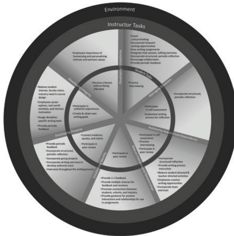
Figure 2. Revision of Leggette and Jarvis' (2015) wagon wheel depiction of Chickering and Reisser's (1993) seven vectors of education and identity development that includes specific writing strategies, components, practices, and techniques that foster holistic development.

We argue the revised model serves as a starting point for designing new curriculum and conducting empirical research related to the holistic development of college-level writers (NCTE, 2009). Because communicators and journalists are the catalysts for driving conversation, new writing curriculum should center on helping students develop their holistic selves, confidence in their writing, critical thinking skills, skills for giving and receiving feedback, and an understanding of their writing values along the way. Structured writing prompts and reflective writing assignments help students develop confidence in their writing skills, create personal meaning, develop a sense of self-assessment, become independent problem solvers, learn from mistakes, develop an authorial voice, and produce original work.