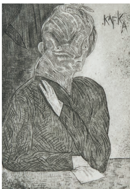
Franz Kafka, “Metamorphosis,” 1984, illus. by Jose Luis Cuevas.

The LEC publications are illustrated and signed by famous artists. Some later volumes include hand-made paper or unusual bindings.