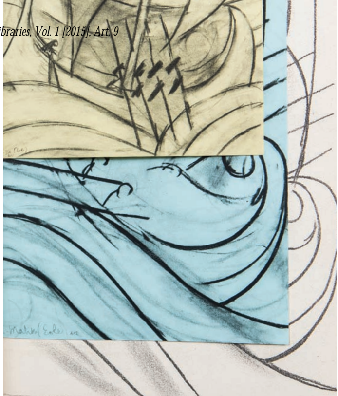
James Joyce, “Ulysses,” 1935, illus. by Henri Matisse.