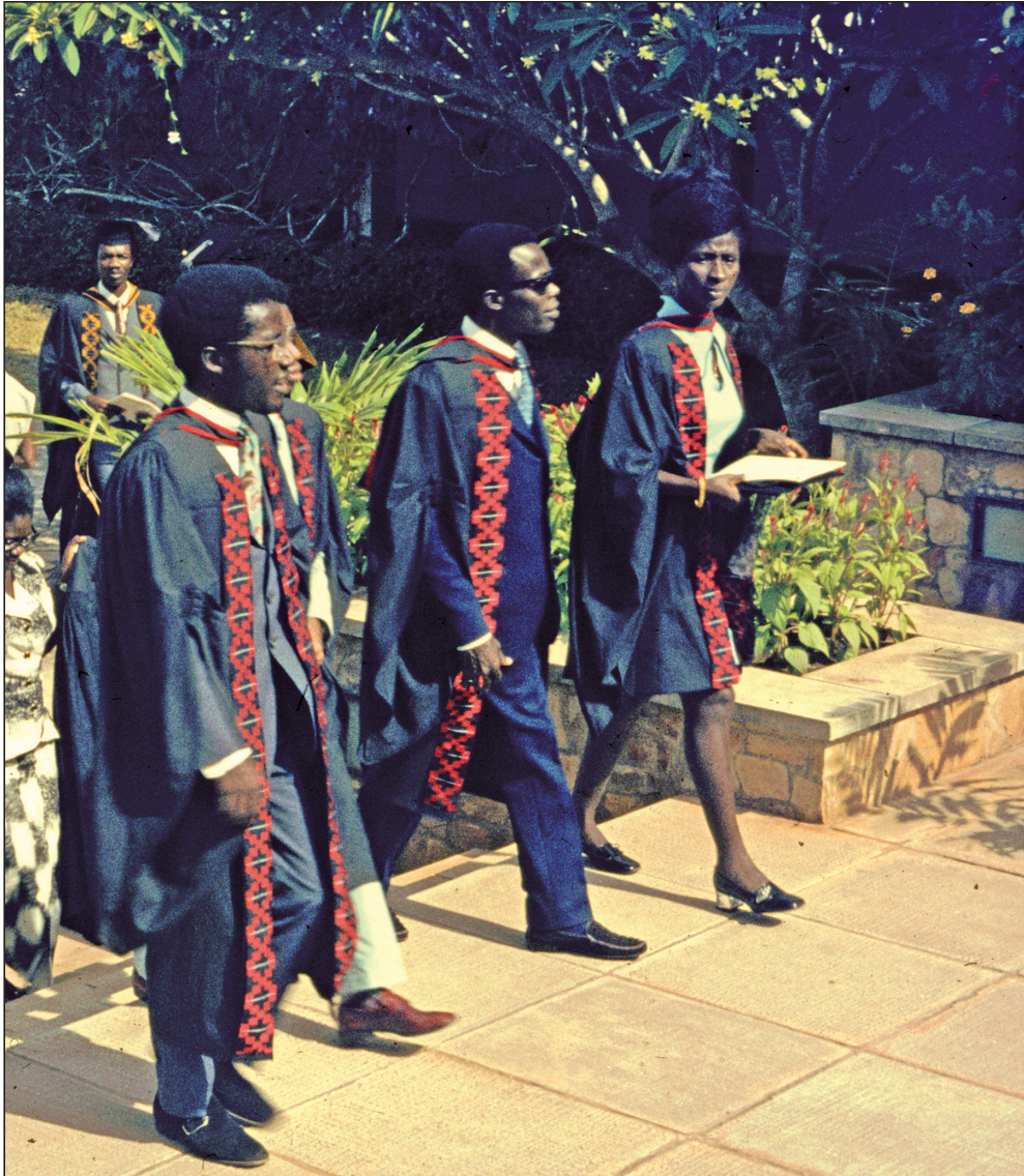
Bachelors at the University of Ghana