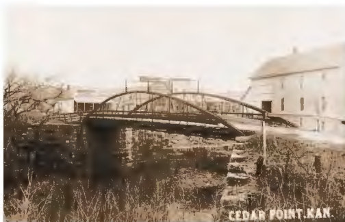
CEDAR POINT BRIDGE & MILL, 1908

I was a city boy and was scolded for not wanting to get into it. My grandfather said this happened when rainwater runoff overflowed the spring.