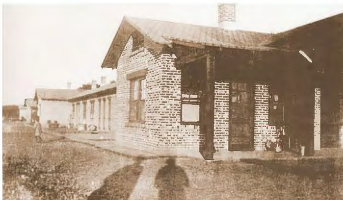
EL RANCHITO LADRILLO, SANTA FE RR EMPLOYEE HOUSING

At the turn of the 20th century, the Santa Fe aggressively recruited labor in Mexico, where they found workers anxious to escape the Mexican Civil War and make a better life for themselves.