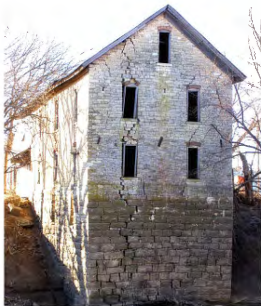
DRINKWATER AND SCHRIVER MILL ca. 1900

While revisiting the area researching this article, I have been confronted with the sad fact that much of the cultural and architectural heritage