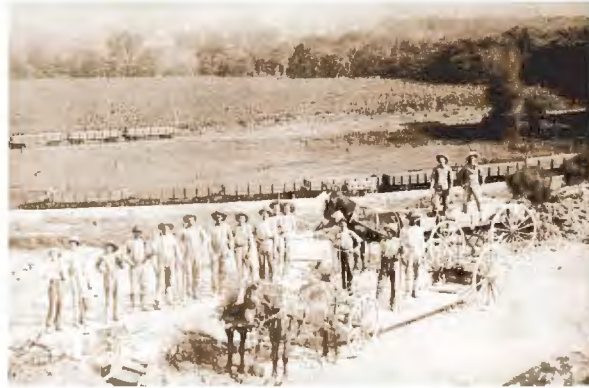
STONE QUARRY AT FLORENCE WITH RAILCARS IN THE BACKGROUND

Florence limestone "was cream colored, it hardened on exposure, was