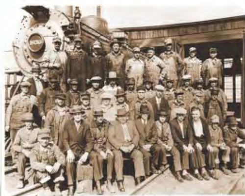
FLORENCE SANTA FE RR EMPLOYEES CA. 1930

When the railroad reached Florence in 1871, the town boomed. By 1875