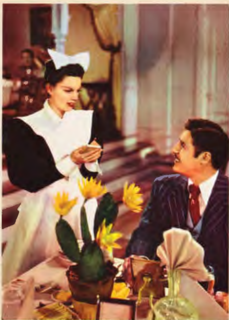
JUDY GARLAND AND JOHN HODIAK, IN A SCENE FROM THE MOTION PICTURE, "THE HARVEY GIRLS"