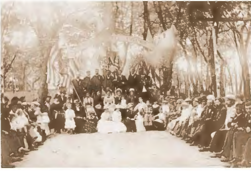
BASTILLE DAY CELEBRATION 1884