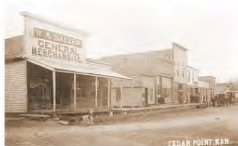
MAIN STREET, CEDAR POINT 1915

I have vivid visual memories of this landscape; moments on the prairie or river that play in my mind