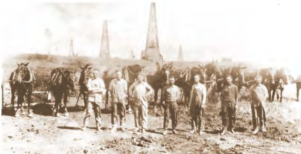
THE FLORENCE OIL FIELD Around 1920

the Florence Harvey House declined in importance as a travel stop. The last trainload was served at the Clifton Hotel on March 31, 1900, when Harvey moved his facilities to Newton.