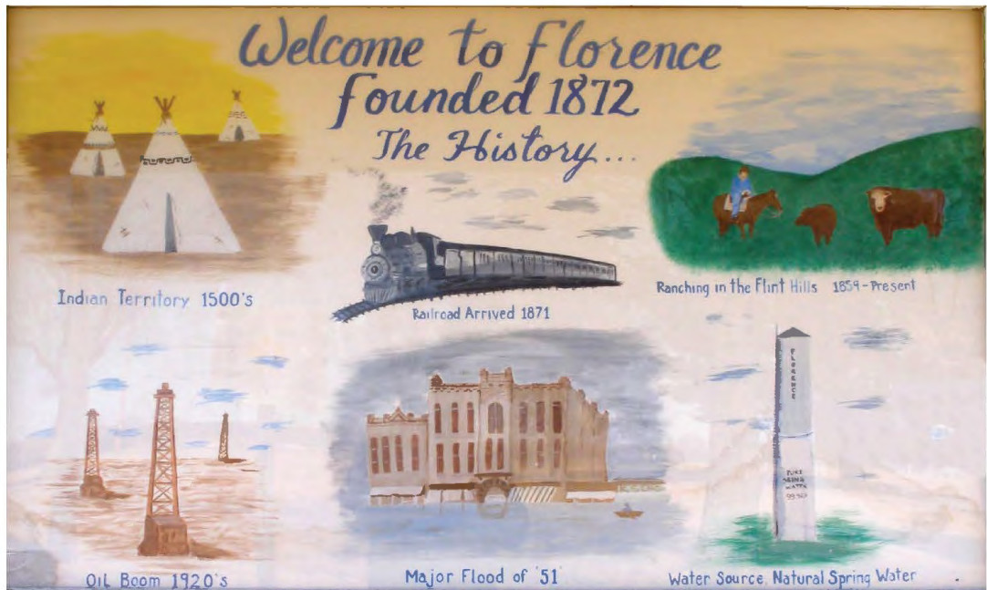
MOSES SHANE PARK, FLORENCE