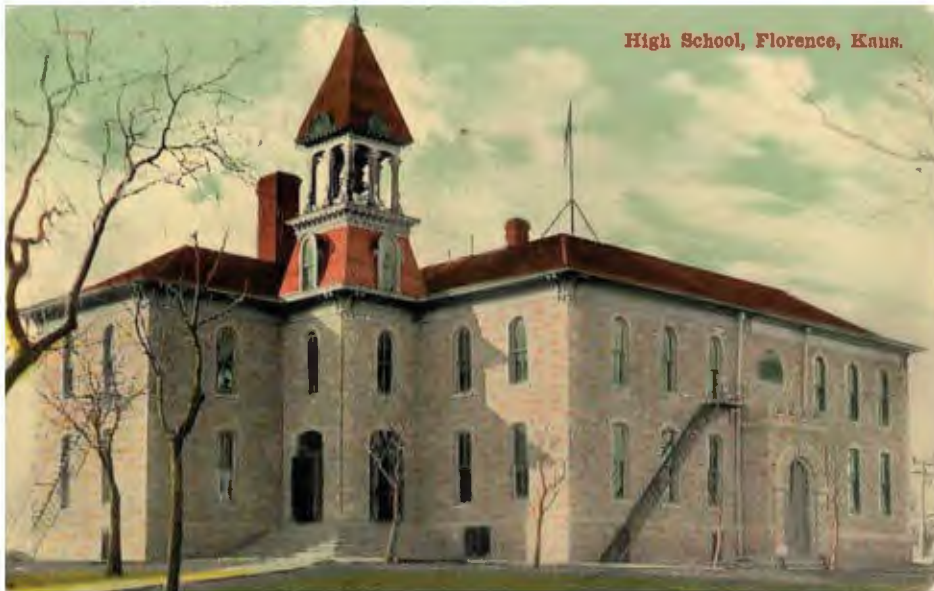
FLORENCE HIGH SCHOOL 1880-2009

Also called City Springs, they are the source of Florence's water supply.