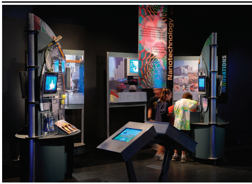
Figure 1. “Nano in Your Neighborhood” Exhibit at the Indiana State Museum

Evaluation has been an integral part of the Center's development and design process since 2004. The Center's staff members are information design specialists who analyze audiences, develop learning objectives, and collect evaluation data for educational exhibits they create. In 2006, the Center's coordinator formed an evaluation team to focus on a particular exhibit developed in the previous year – a 500-square-foot multimedia exhibit titled “Nano in Your Neighborhood” focused on nanotechnology education (Figure 1).