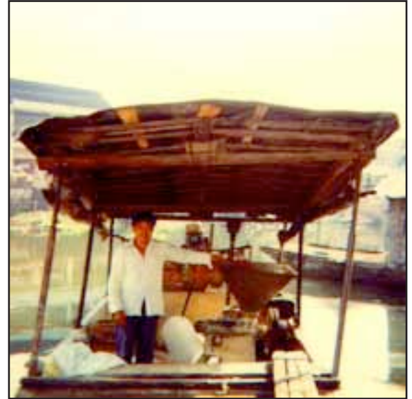
Figure 4. Snakes and snake products can be marketed more efficiently with better means of transportation. This cargo raft represents a villager's perceived need for improved transportation systems.