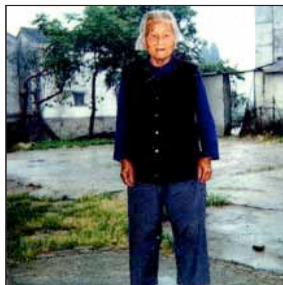
Figure 10. This village grand lady turns 100 years old in a couple of months. She symbolizes to a villager the need for better elderly care.

The disparity between the number of photographs depicting each of the above categories and the priority assigned to each may be noteworthy. While a majority (42%) of the photographs fit into the “increased income” category, the villagers deemed the category as only fourth in importance, following diversification, transportation, and improved markets. Several factors may have contributed to this priority list. First, it is possible that some nuances in responses may have been lost in translation. The villagers also may have found it difficult to find objects in their immediate environment that depicted some of their concerns. Also, three of the four photographs that fell under “planning for diversification” were taken by a participant who helped oversee the village government. Used to government-directed initiatives, the villagers may well have looked up to him for leadership in determining how to prioritize their categories of need.