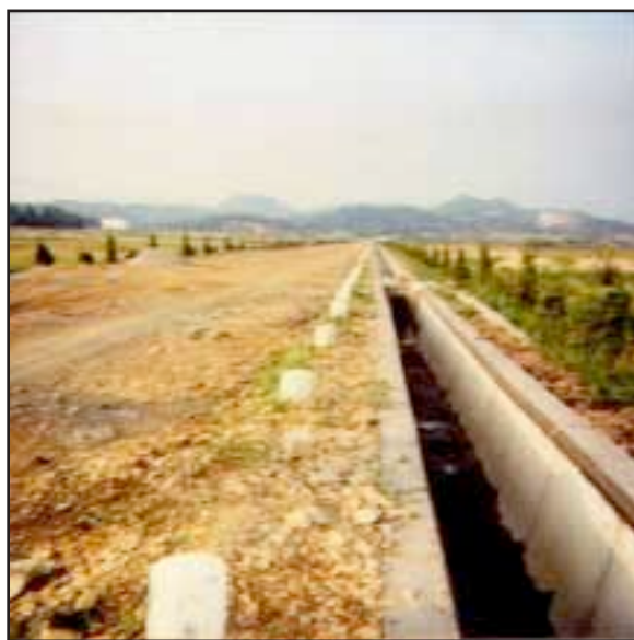
Figure 9. Environmental protection as a priority area comes up in this picture of pipes for the new village water system.