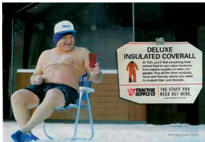
Figure 3. Tractor Supply Advertisement for Insulated Coveralls

There is a sense of innocence about the man, as he is holding a cup and smiling at it as if he was trying to capture the snowflakes that are falling around him. Goffman (1979) described how advertisers will present men in ludicrous or childlike poses to make them appear unreal, and in turn preserve the image of strong, smart men. This connotes that while this man appears to be childlike, he is still a man, and as the mission of TSC states: “work hard, have fun, and make money...” The man