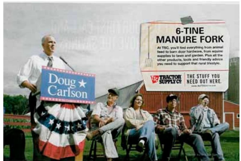
Figure 1. Tractor Supply Advertisement for a Manure Fork

The setting for the image is something that most minds conjure when thinking of farming life: the red barn, green grass, clear skies, wood fence, and crops in the background. The green grass and blue skies in the advertisement connote freedom and purity by showing the beauty of nature. The barn, fence, and crops continue to play on the image of rural America, bringing the idea of simplicity, hard work, and trustworthiness to the viewer’s mind. These connotations are then transferred to the