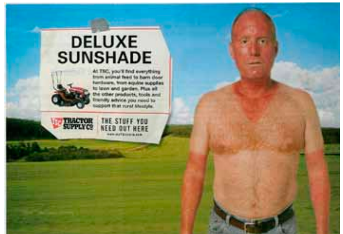
Figure 2. Tractor Supply Advertisement for a Tractor Shading Canopy

Behind him is a typical rural scene of rolling fields, trees, and a dirt road. The background of the image connotes the freedom and openness of the scene. This naturalistic scene shows the viewer a simple life that allows one to feel the serenity of the image (Kellogg Foundation, 2002). By transferring this idea onto the product, the viewers feel that by buying the item, they will experience the same freedom to explore nature and live a simple life. The farmer in the advertisement is shirtless and wearing blue jeans. By using an older gentleman, the advertisement symbolizes his age and wisdom. He demonstrates the classical “farmer’s tan” with a burnt face, neck, and arms, and a pale chest and shoulders. This plays into the idea that farmers are typically out in the field for many hours and will have burn lines around their shirt. This does contrast with his age and wisdom, showing he had a lapse in judgment by allowing himself to get burnt. By looking straight at the viewer, he appears to be saying, “I am you and if you do not want to be in the same pain I am, you should buy this product.”