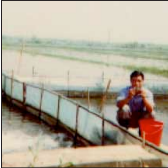
Figure 3. A lone fisherman at work represents a villager's perceived need for the community to diversify its economic activities.

The need to diversify their economic base topped the list of villagers' development priorities. A photographic depiction of this primary concern is shown in Figure 3. This development concern was followed by better transportation (Figure 4), more markets (Figure 5), and the desire to increase personal incomes (Figure 6), in that order. Better community relations, more adequate health care, and a concern for their children's future (Figure 7) were categories that occupied the middle part of their development priority list. Improved housing (Figure 8), environmental protection (Figure 9) and care for the elderly (Figure 10) completed their needs inventory.