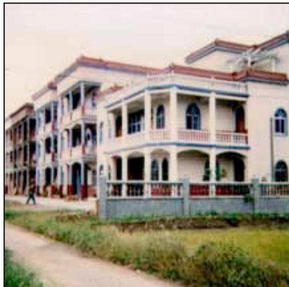
Figure 8. A new apartment complex outside the village represents the desire for better housing.