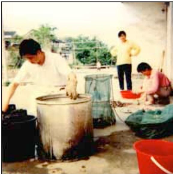
Figure 5. Two vendors in the background have arrived to purchase snakes, a representation of "more markets" as a major concern.