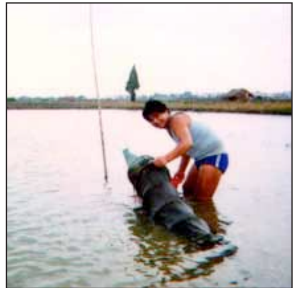
Figure 6. A shrimp harvester earns more than a snake farmer, according to a villager for whom this photograph means the need for higher incomes.