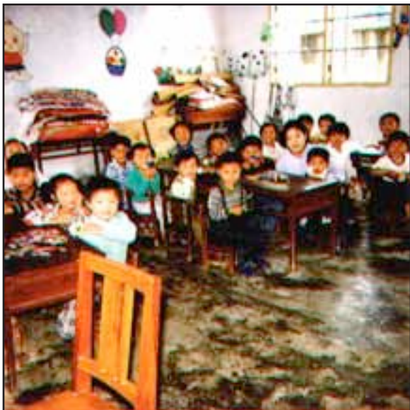
Figure 7. Pre-school children at a day-care center illustrate child care as an important concern.