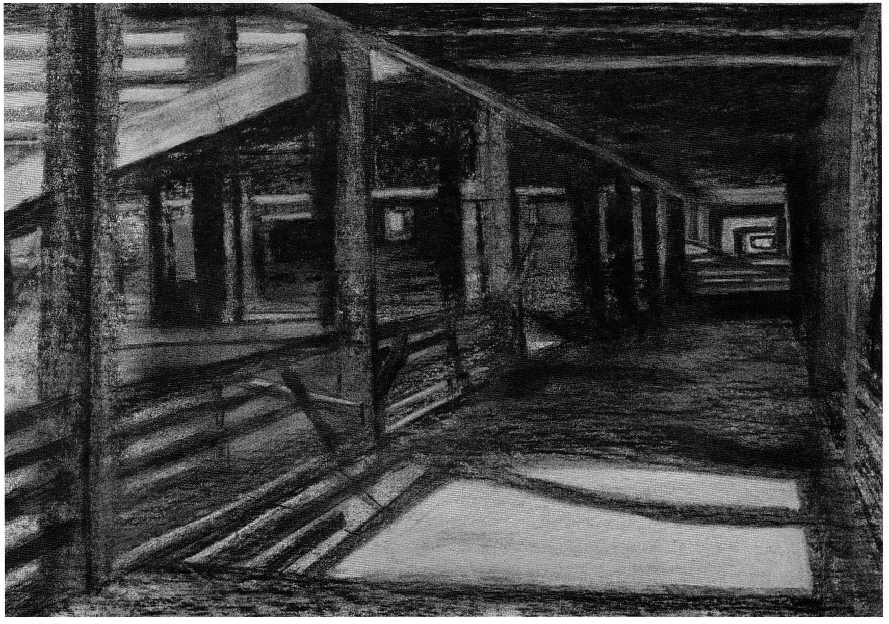
Solitude (Kansas City Stockyards)

perfect curve, that beautiful smooth curve—only after teasing the idea of the drawing, attentive to responses by the medium. Lines as both a means of inquiry and a means of expression of the discovered. Line as trace evidence of a process. Are we able to reveal for ourselves what we are searching?