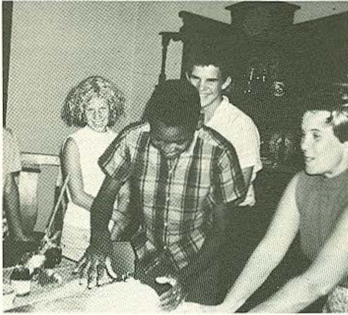
Verbalizing the feel of bread dough is a new and different effort for class members, who have to grope for words to describe the sensation.

numerable natural opportunities for the staff to correct or to reinforce the verbalizations of each of the subjects.