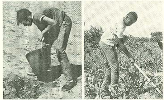
BELOW, RIGHT: Members of the class cultivate their crop of corn—for popcorn—while they cultivate their language.