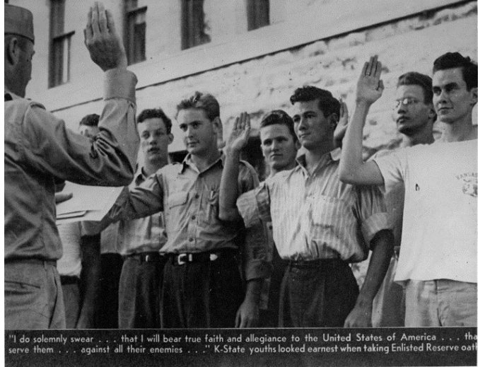
"I do solemnly swear . . . that I will bear true faith and allegiance to the United States of America . . . that I will defend the same . . . against all their enemies . . ." K-State youths looked earnest when taking Enlisted Reserve oath.

As expected, enrollment declined during the war years to a low point of around 1,500 in 1944 (when the troops returned home enrollment rose to almost 7,500 by 1948!).