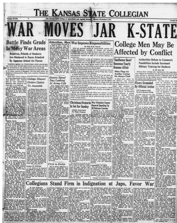
The Collegian, December 9, 1941

approximately 1,300 K-State male students were required to register for the draft. Still, an article in the Collegian expressed the view that a college education and the training of the brain was just as important as preparing for battle.