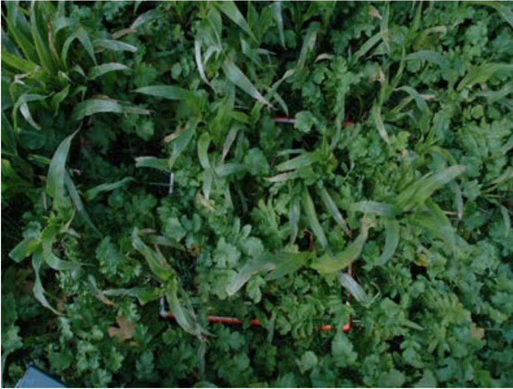
Figure 1. Tillage radish planted after corn harvest; center square is 1 sq. yard.