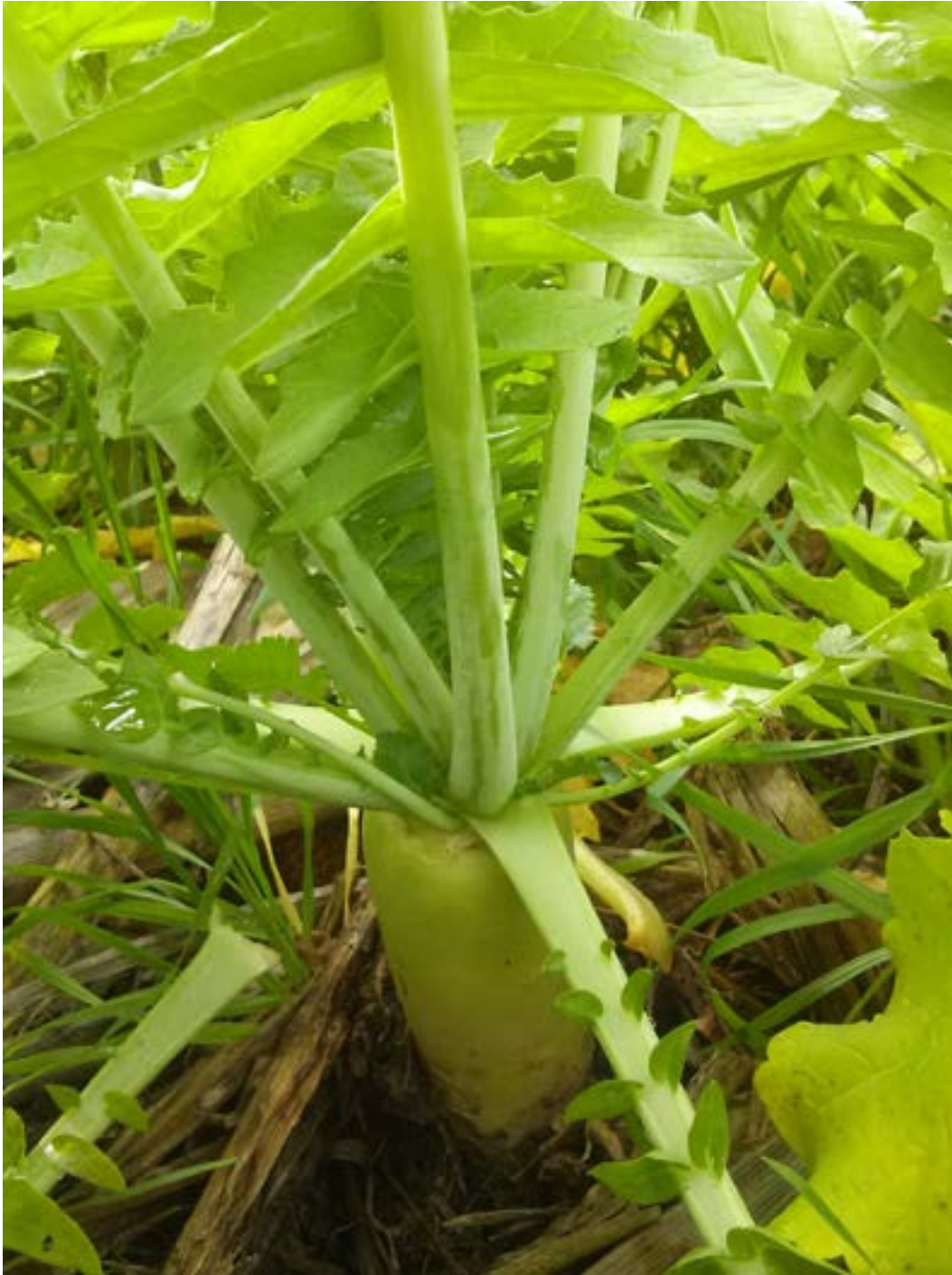
Figure 2. Tillage radish planted after corn harvest. The large taproot of the tillage radish creates macropore spaces, improving soil aeration and providing a good seed bed for subsequent crop.