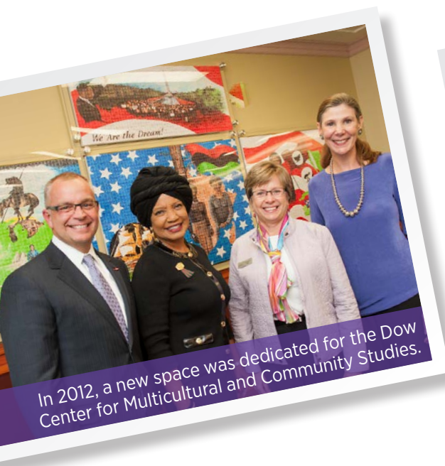
In 2012, a new space was dedicated for the Dow Center for Multicultural and Community Studies.