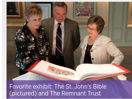
Favorite exhibit: The St. John's Bible (pictured) and The Remnant Trust