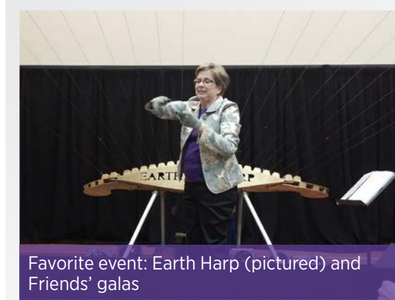
Favorite event: Earth Harp (pictured) and Friends' galas

22 PUBLICATIONS including books, articles and conference papers