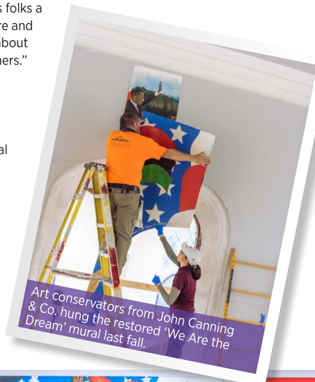
Art conservators from John Canning & Co. hung the restored 'We Are the Dream' mural last fall.

floor space was home to the Minority Resource and Research Center. The fire started on the roof almost directly above the mural. Subsequently, the mural suffered from significant water damage and soiling—it even