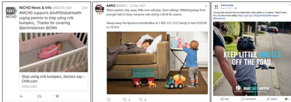
Figure 1. Social media posts viewed by parents. Left: Safe sleep (mismatching), Middle: Poison prevention (mismatching), Right: Bike safety (matching)

recommends parents store "all medicines up and away." The bike safety post features an image of a young child, wearing a helmet while riding a bike on a sidewalk with the help of a parent. This image is matched to the recommendation in the text which states that "young children should bike on sidewalks, bike paths or in parks."