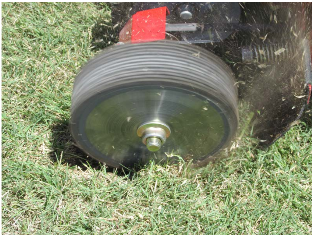
Figure 1. Divots were made using a modified lawn edger. The standard edger blade was removed and replaced with 13, 7.25 in carbide tip circular saw blades 0.079 in. thick. The modified lawn edger created a standardized divot (5.5 in. × 2.125 in. × 0.125 in.) in each plot.