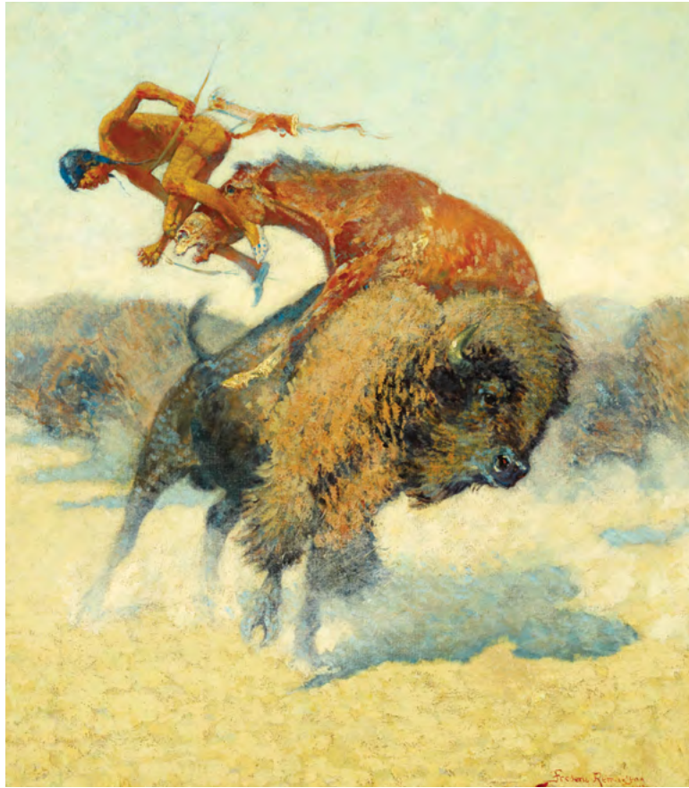
ABOVE: AN EPISODE OF THE BUFFALO HUNT Frederic Remington From the collection of Gilcrease Museum, Tulsa, Oklahoma