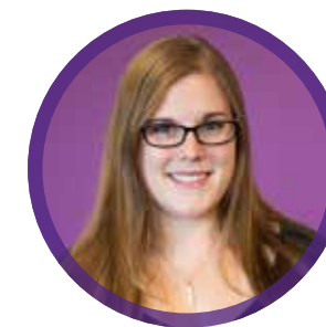
BRICE G. HOBROCK DISTINGUISHED FACULTY AWARD

ALL AWARDS ARE FUNDED BY THE FRIENDS OF THE K-STATE LIBRARIES.