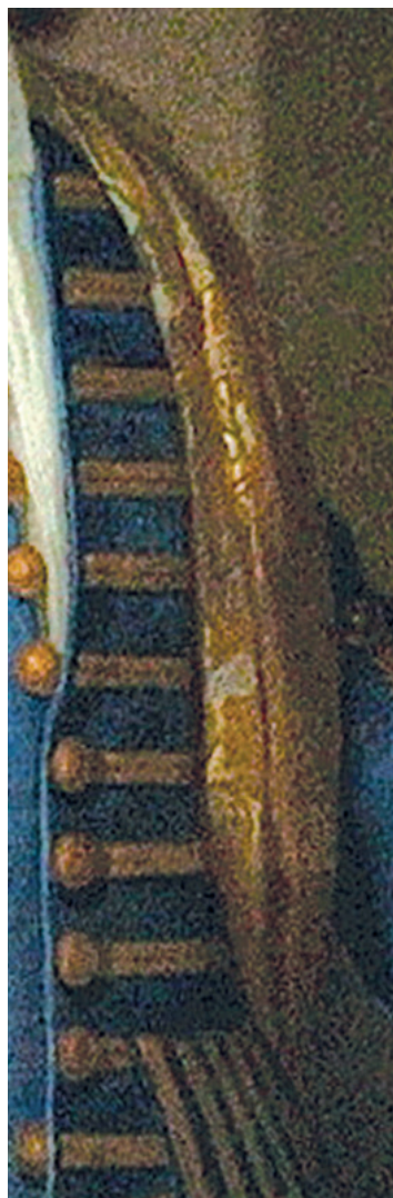
FIG. 4 Details of Fig. 1.