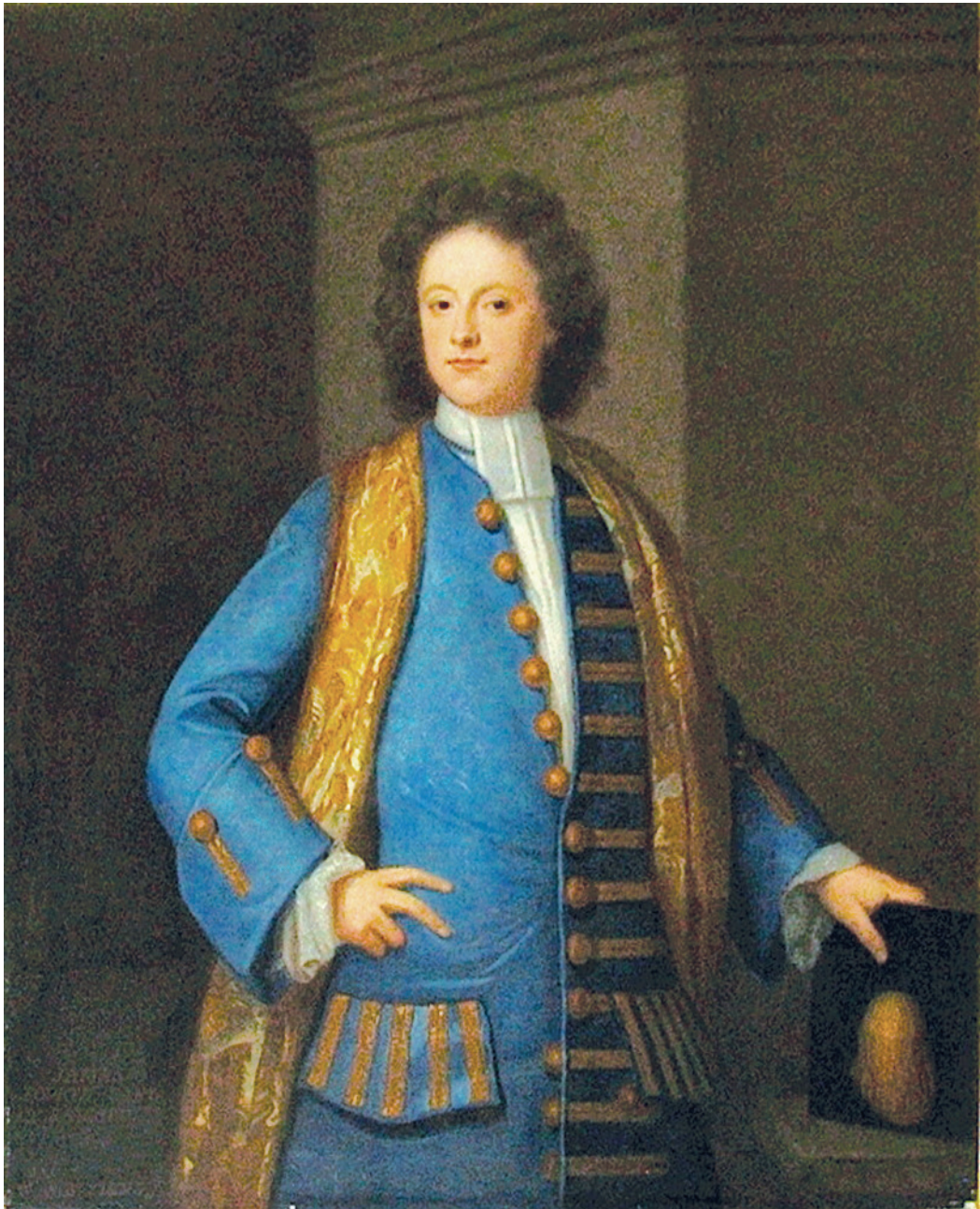
FIG. 1 James Cecil, Fifth Earl of Salisbury, who lived 1691–1728.