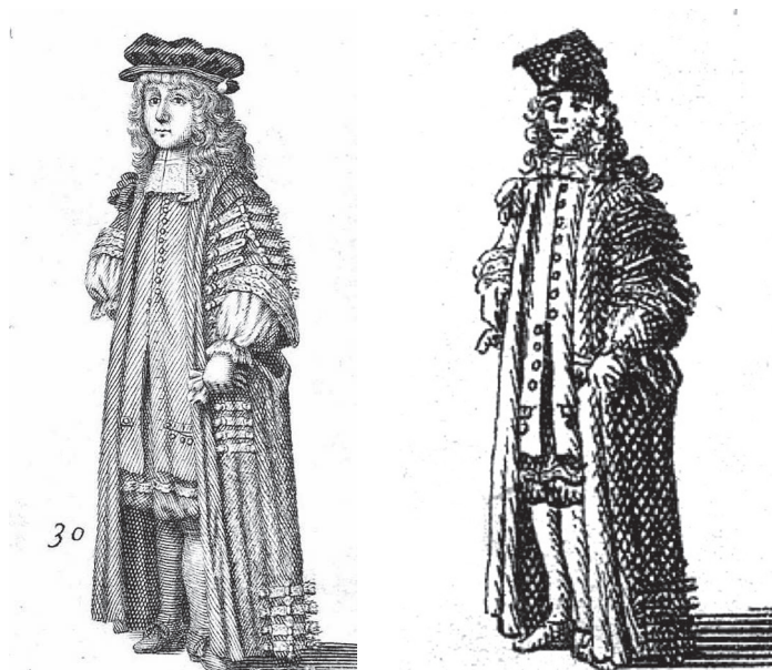
FIG. 3 Nobleman from Loggan 1675 (left), van der Aa 1707 (right).

soever presume to wear a Square Capp, but onely those who are allowed by Statute. 9