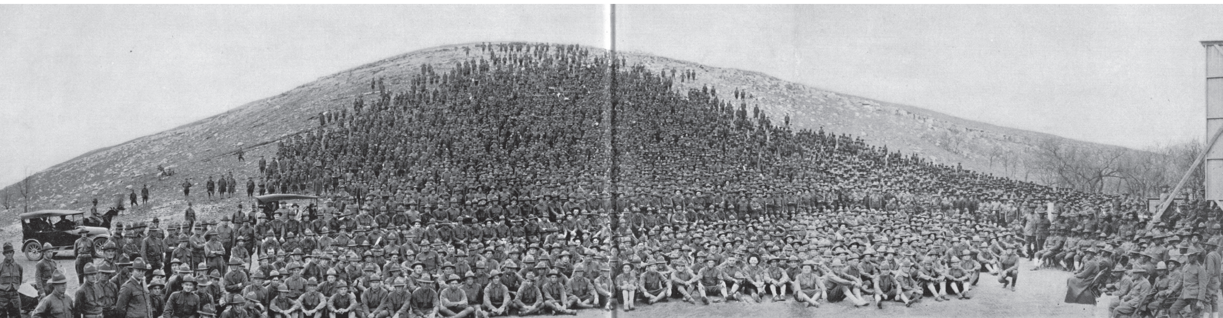
FIRST ENTERTAINMENT GIVEN THE NEW ARRIVALS AT THE