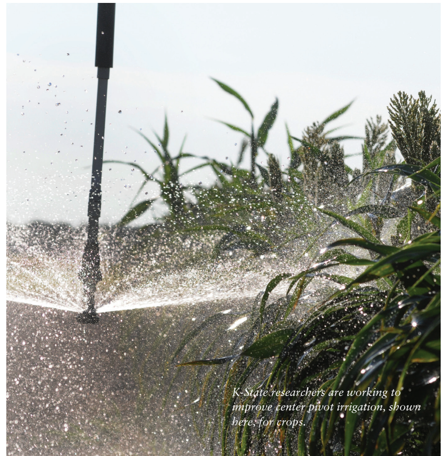
K-State researchers are working to improve center pivot irrigation, shown here, for crops.

"The overriding philosophy of these research efforts is to reduce water use in this region and help producers gear up for the eventuality that