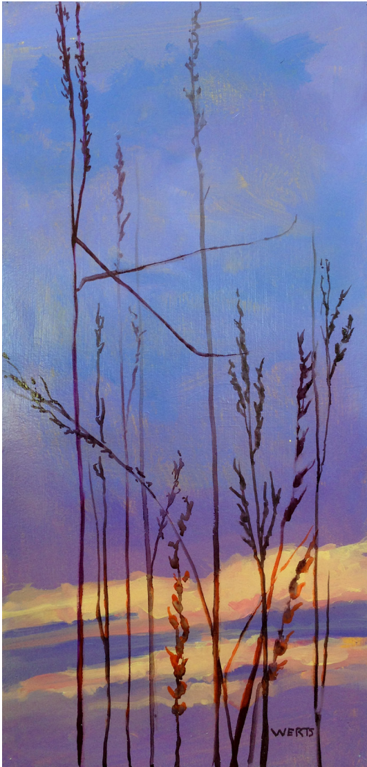
Prairie Cadence #4 Diana Werts