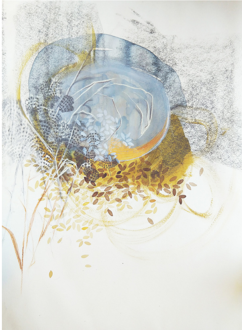
Rewilding #1 Kelly Yarbrough