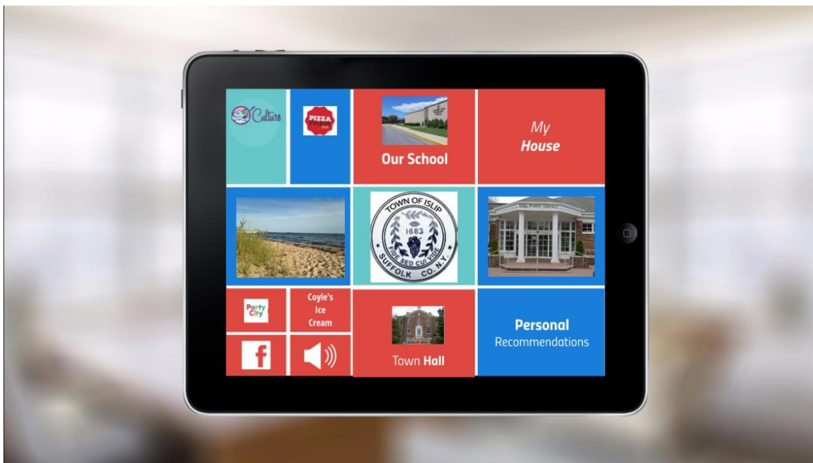
Figure 4: This is the Prezi with "tiles" that are linked to the Power Point slides. Students use a link for home viewing.

I had to take more control over the creation of the Prezi because many students lacked experience with this format (See Figure 4). The students viewed voluminous amounts of potential backgrounds and templates. A major benefit of utilizing Prezi is the easy and seamless integration of Power Point slides. The students eventually settled on a setup that looked like an iPad and each “tile” or “icon” was styled to look like a photo or logo of the business or place that is linked to it. These “tiles” could be clicked on, and the accompanying Power Point slide would show up. I spent a few days completing this part of the project and then shared the presentation and the access link for home with the students. They were excited to take these links home to show their families and friends.