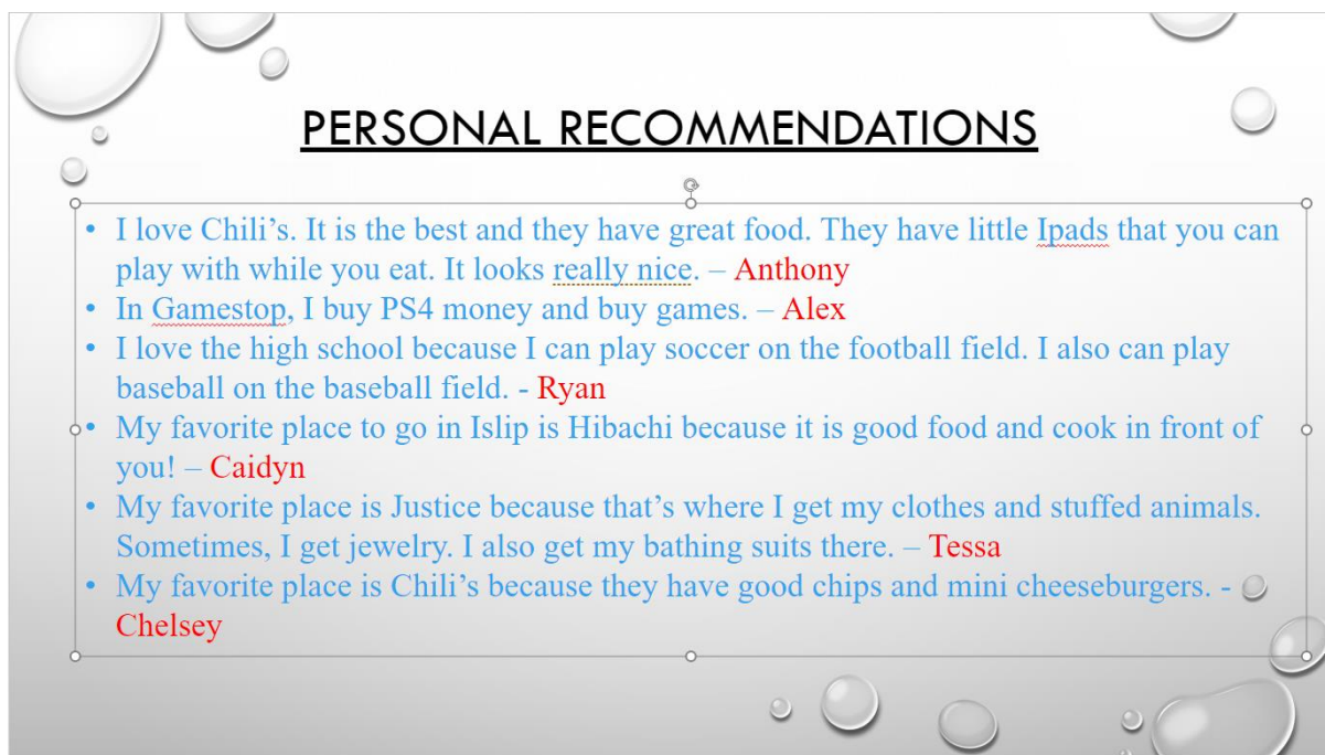
Figure 3: This was an example of the "Personal Recommendations" slide that allowed everyone to pick a place of their choice.