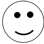
A Little Happy