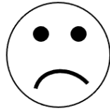
A Little Upset