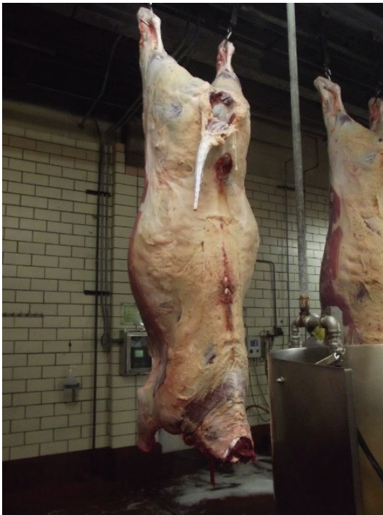
Figure 2. Example of carcass bruising observed along the dorsal midline of finished cattle carcass.