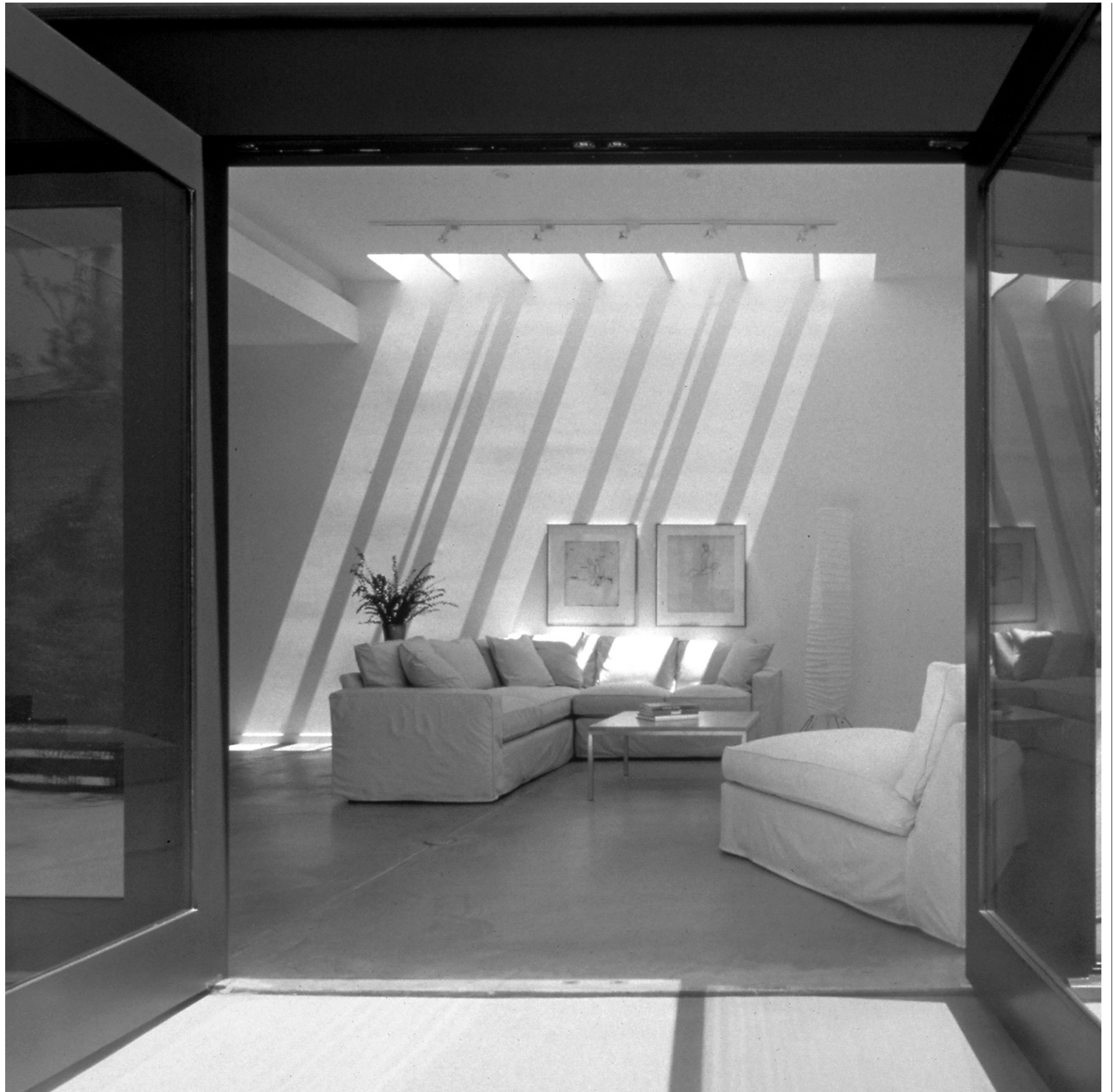
Figure 11. Living space as seen from the patio.