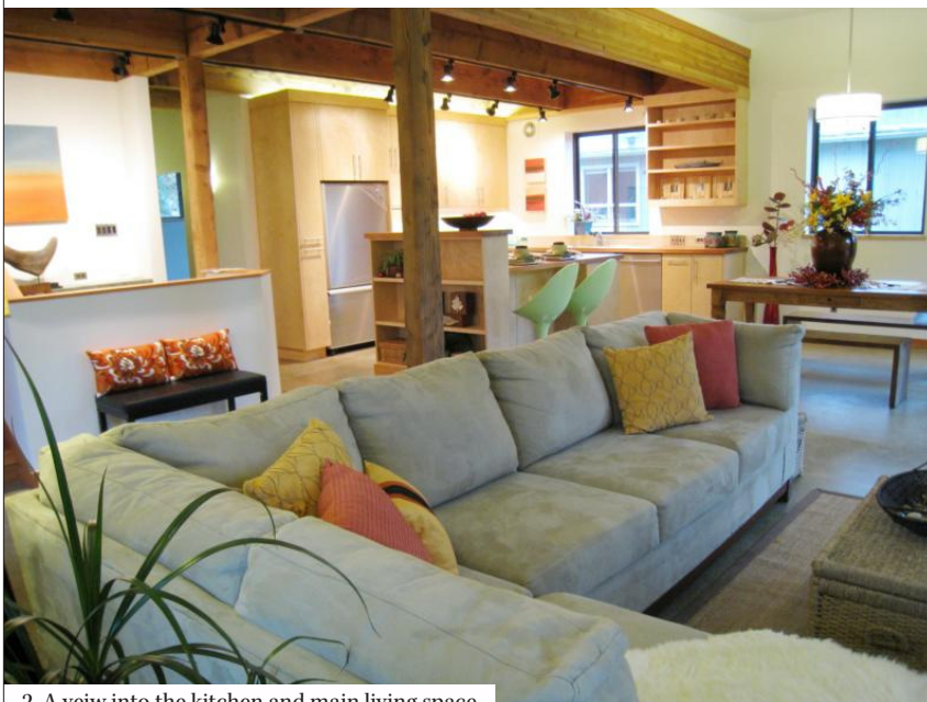
2. A view into the kitchen and main living space.

The Internet community varies enormously in terms of the credibility and experience of those offering