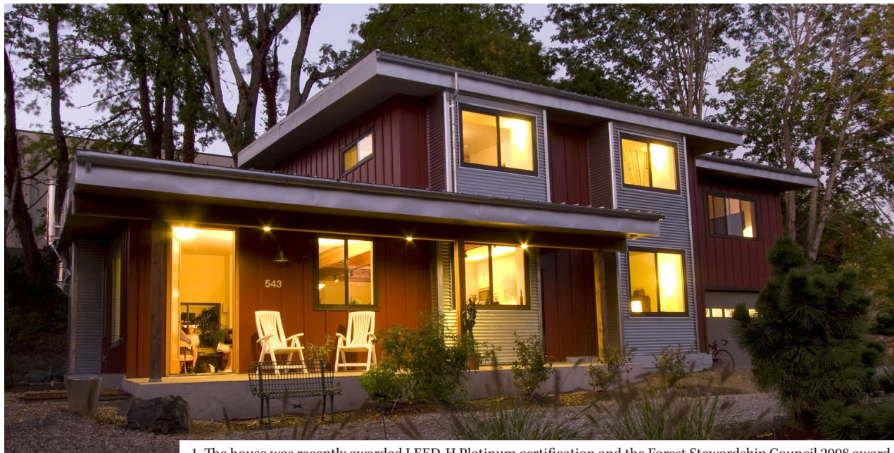
1. The house was recently awarded LEED-H Platinum certification and the Forest Stewardship Council 2008 award.