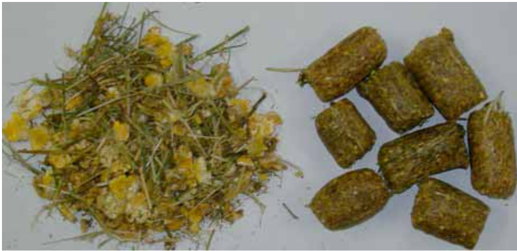
Figure 1. Physical form of the steam-flaked corn (left) and extruded (right) diets fed to cattle.