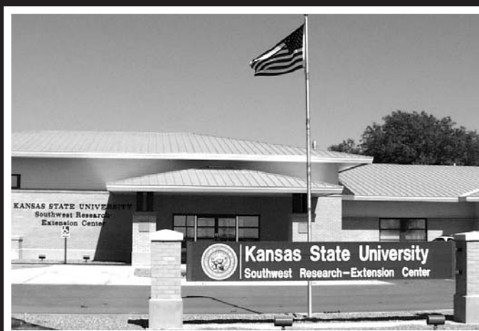
Southwest Research-Extension Center