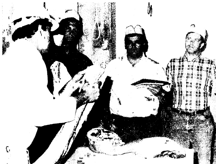
A meat evaluation class in the new meats laboratory.

a Indicates price differential is statistically significantly different from zero at the 95% confidence level.