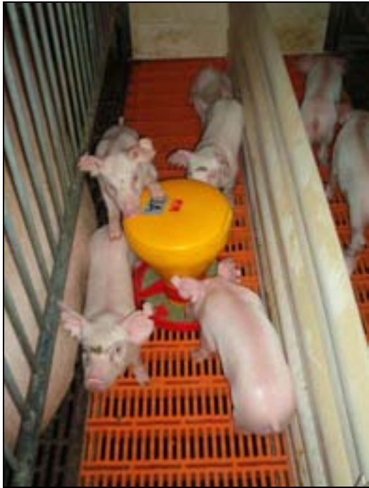
Figure 1. Rotary Feeder With Hopper (Control).

to manage creep feeding and to maximize the number of eaters in the litter.