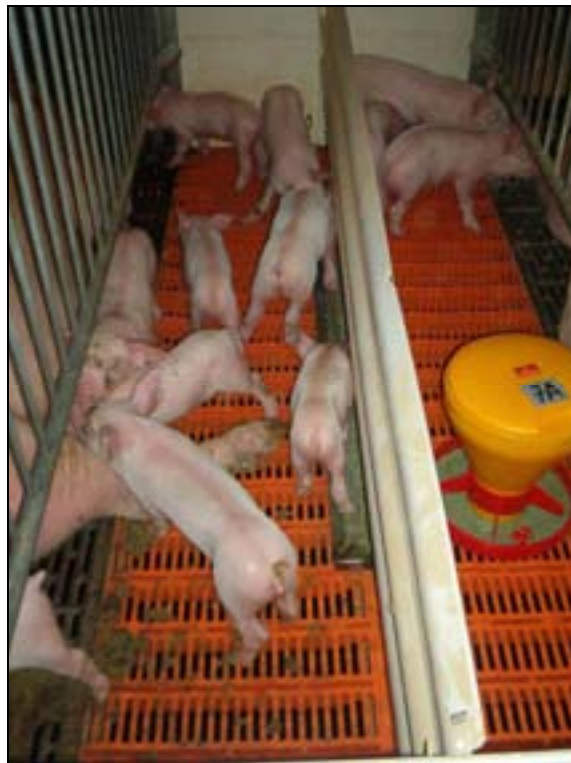
Figure 3. Pan Feeder.