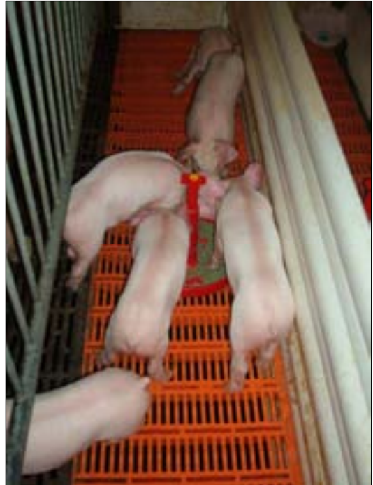
Figure 2. Rotary Feeder Without Hopper.