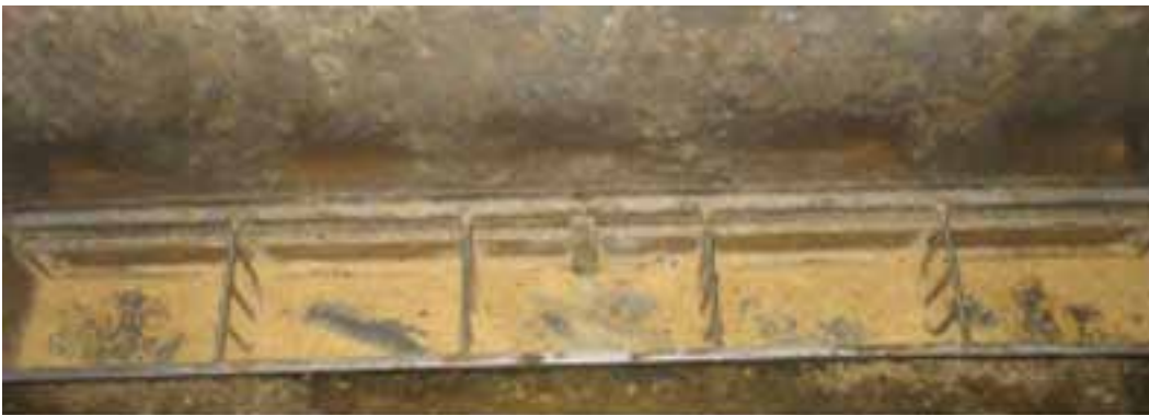
Figure 2. Conventional dry feeder with pelleted diets averaging 61% feeder pan coverage, Exp. 2.