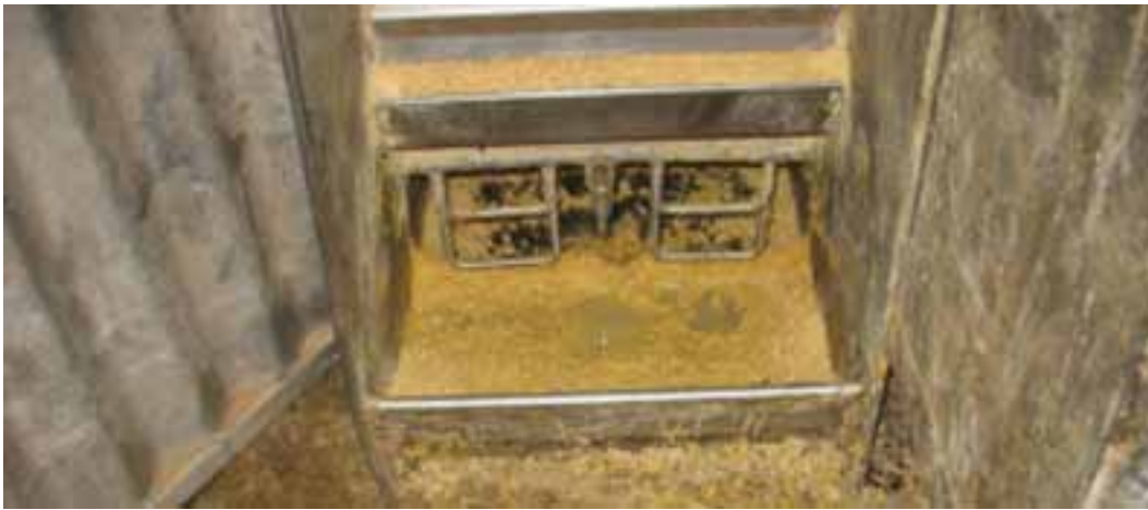
Figure 4. Wet-dry feeder with pelleted diets averaging 74% feeder pan coverage, Exp. 2.