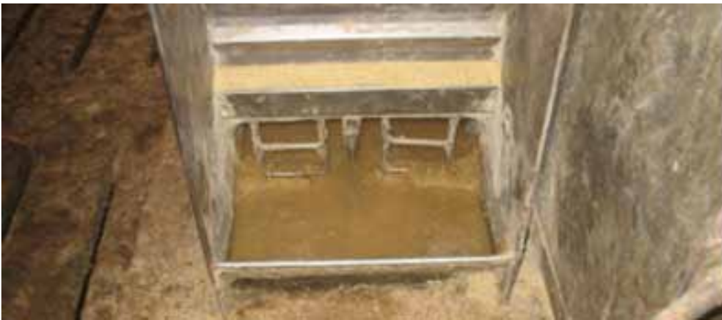
Figure 3. Wet-dry feeder with meal diets averaging 64% feeder pan coverage, Exp. 2.