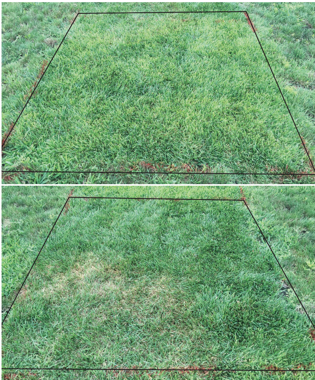
Figure 3. Brown patch in the zoysiagrass/tall fescue mixture (top picture) compared to the tall fescue monostand (bottom picture) in August 2016 in Manhattan, KS.