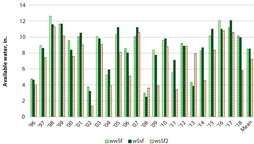
Figure 2. Available soil water in 6-ft profile at planting of sorghum in several rotations at Tribune, KS, 1996–2018. Capital letter denotes current crop in rotation (W, wheat; S, sorghum). The last set of bars (Mean) is the average across years. Wheat-sorghum-sorghum-fallow (WSSF) and wheat-wheat-sorghum-fallow (WWSF).