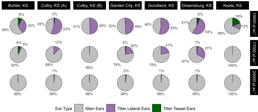
Figure 2. Ear development data by plant density, partitioned and shaded by ear type. Pie charts represent the total harvested ears, with slices representing the percentage of total ears belonging to each development category. Hybrids were averaged together and plots with tillers removed were not considered. All tested sites are shown.