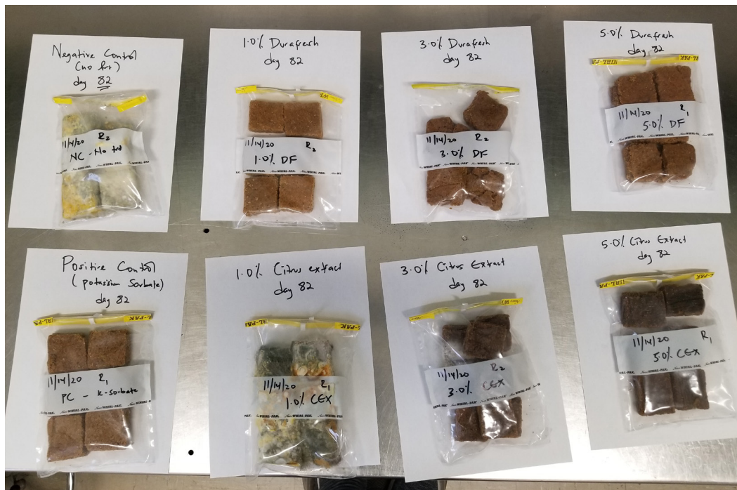
Figure 2. Different stages of mold growth in semi-moist pet treats treated with different levels of citrus extracts and EverWild after 82 days of storage at 77°F.