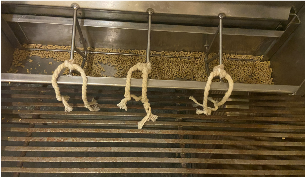
Figure 1. Ropes secured to dividers in the feed pan. On d 0, a rope (~ 22 inches long) was secured to each of the dividers in the feed pans of the feeder (3 total/feeder).