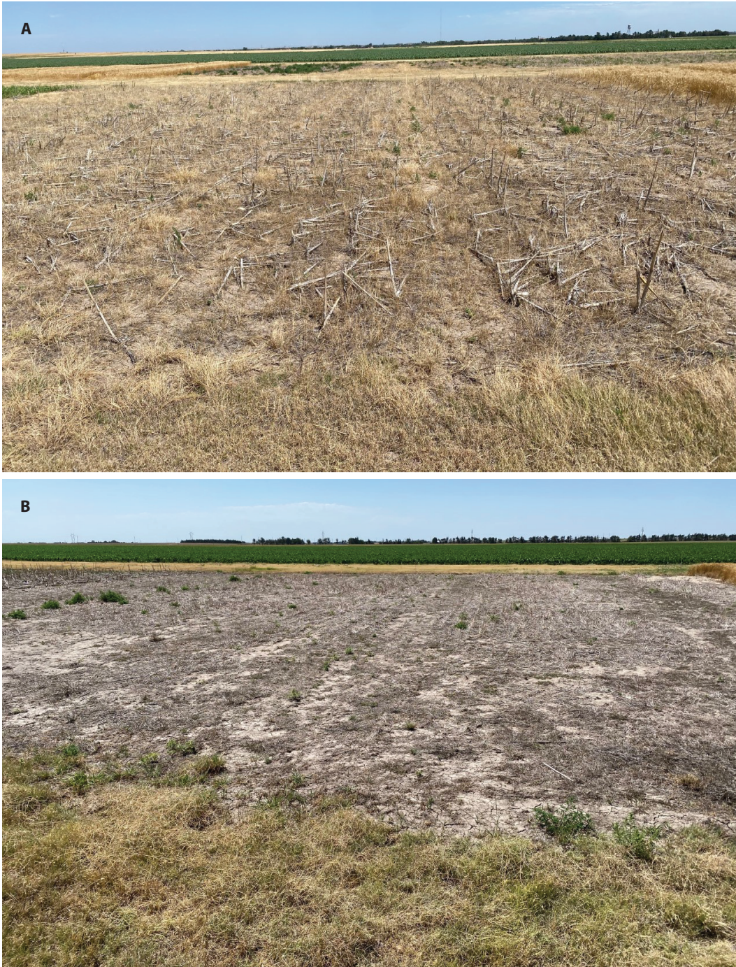
Figure 1. Various weed species and densities within the plots prior to tillage. Photo A is a wheat-sorghum-fallow (WSF) rotation, and photo B is a wheat-fallow (WF) rotation.