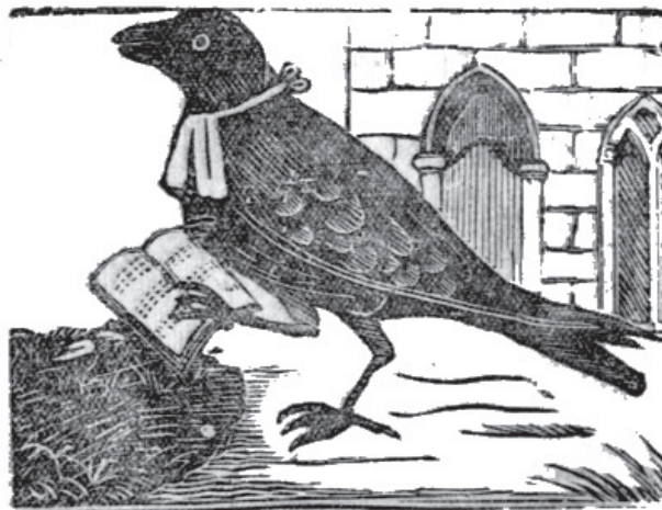
FIG. 1 The archetypical 'hooded crow'—the avian community's parson—the rook, complete with bands and book. Illustration from The Death of Cock Robin from the Child's Amusing Library series of books.