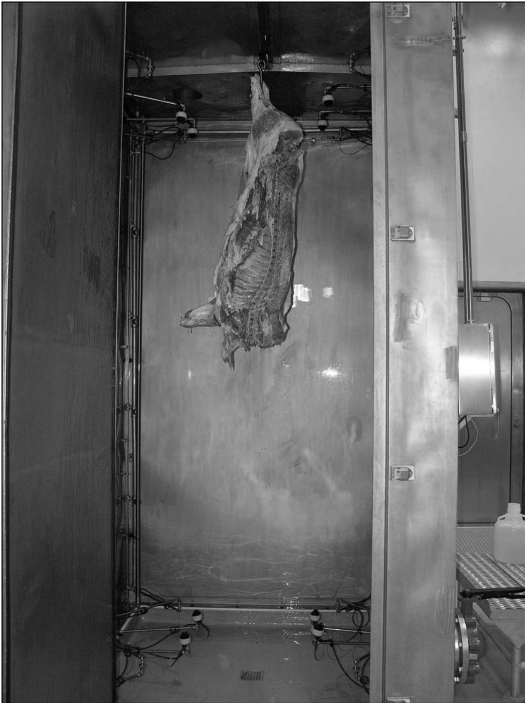
Figure 1. ESS cabinet dimensions were 6 feet \times 5.87 feet \times 11.42 feet.