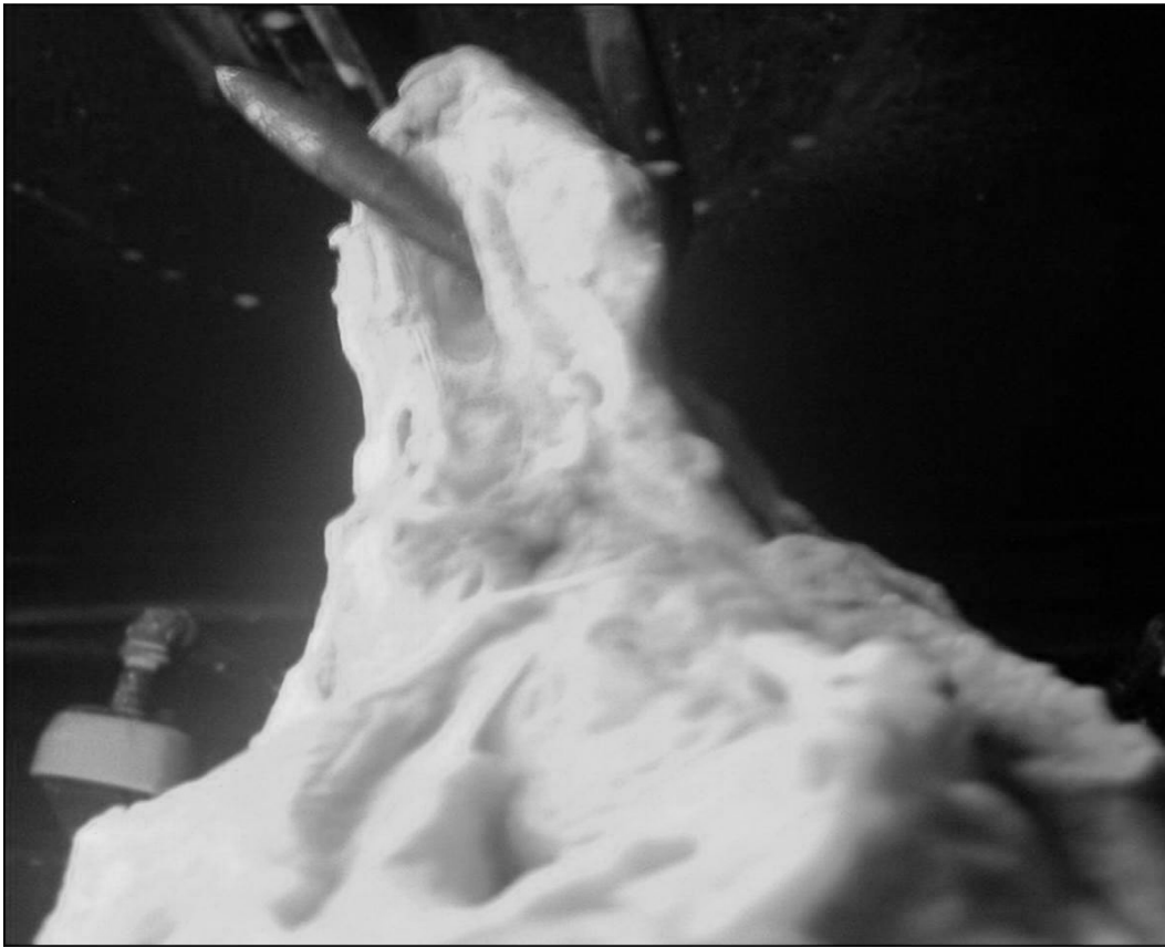
Figure 2. After application of fluorescent dye, the hock area was observed using a black light to determine the uniformity of dye deposition onto all carcass surfaces.