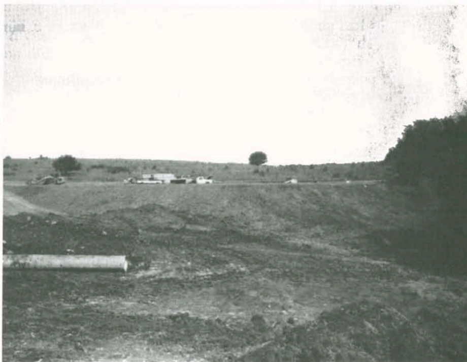
Site Preparation of the New KSU Segregated, Early-Weaning Facility.