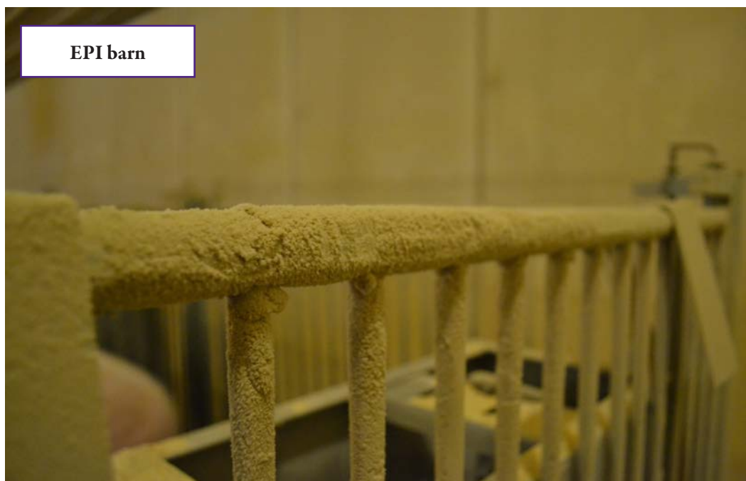
Figure 1. Dust accumulation on pen railing in experimental barns.