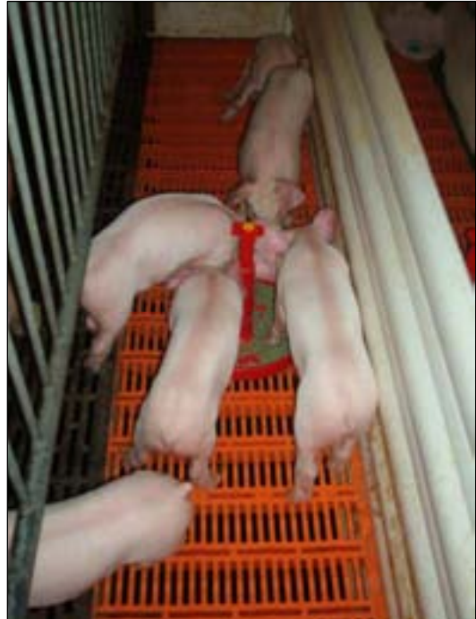
Figure 2. Rotary Feeder Without Hopper.