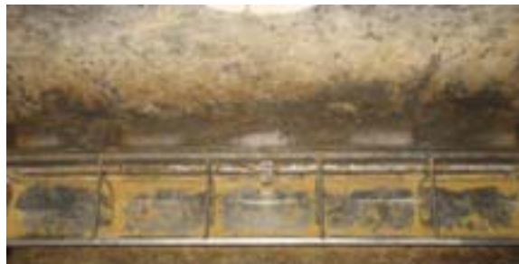
Figure 2. Example of pan coverage for feeder setting 5.