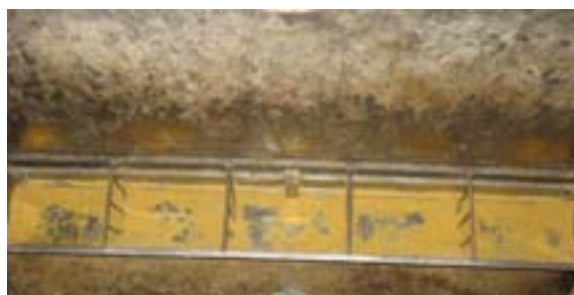
Figure 4. Example of pan coverage for feeder setting 1.