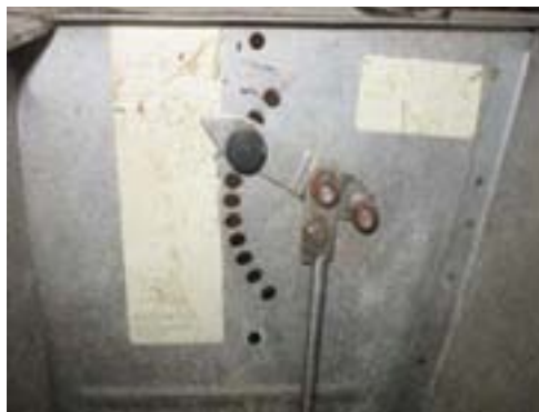
Figure 1. Example of STACO stainless steel dry feeder on feeder setting 3.

trough to the bottom of the feed plate when the feed plate was in the high position was approximately 1.15 in. The amount of feed covering the bottom surface of the feeder pan for this setting averaged 61%. However, the range for individual feeders on this adjustment setting was large with a range of 14 to 93%. On the basis of this data, our recommendation is for feeders to be adjusted to allow feed to cover slightly more than half of the feed pan without feed accumulating in the corners.