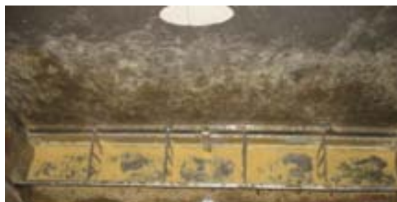
Figure 3. Example of pan coverage for feeder setting 3.