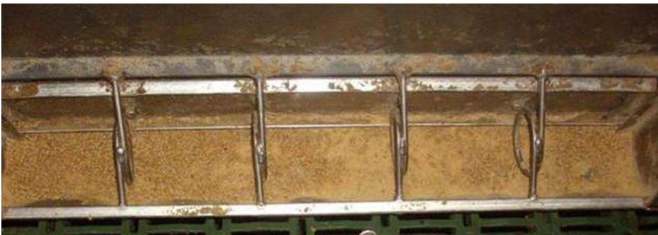
Figure 12. Wide feeder adjustment with screened pellets (minimum feeder gap was 1.00 in. with a maximum gap of 1.25 in.) averaged 97% feeder pan coverage.