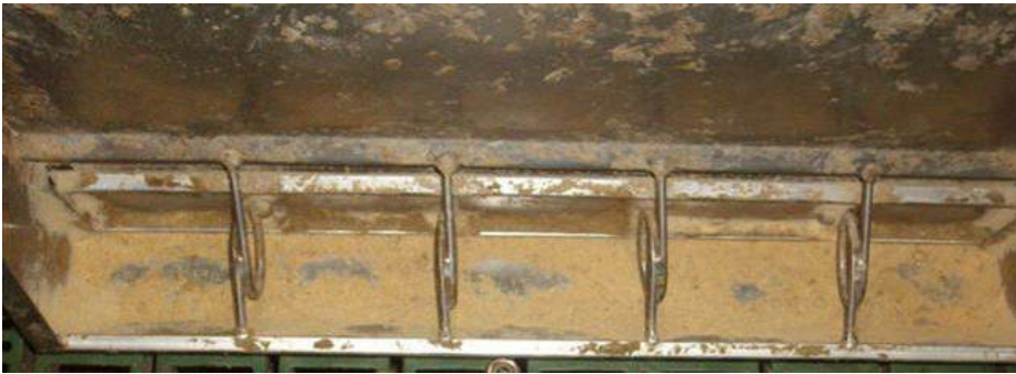
Figure 8. Narrow feeder adjustment with 70% pellets + 30% fines (minimum feeder gap was 0.50 in. with a maximum gap of 0.75 in.) averaged 61% feeder pan coverage.