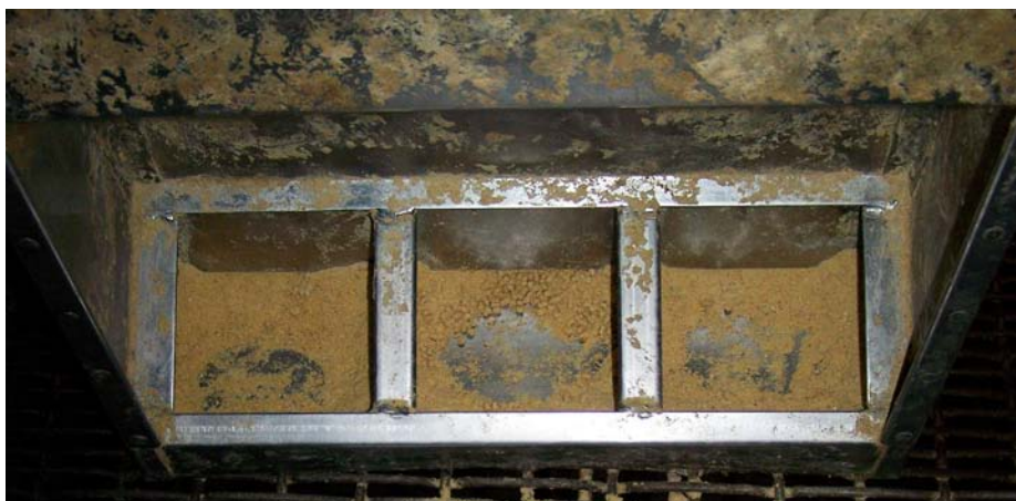
Figure 2. Narrow feeder adjustment with 70% pellets + 30% fines (minimum feeder gap was 0.50 in. with a maximum gap of 0.75 in.) averaged 46% feeder pan coverage.