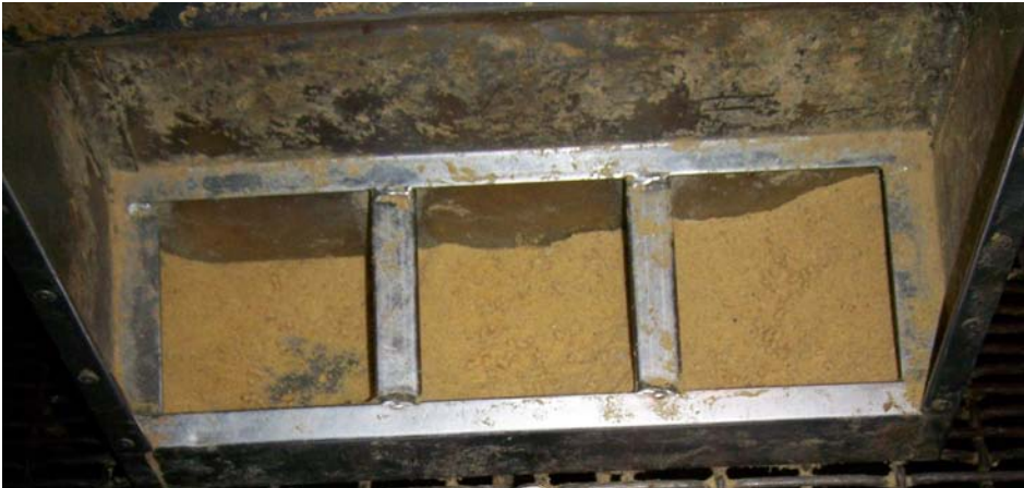
Figure 5. Wide feeder adjustment with 70% pellets + 30% fines (minimum feeder gap was 1.00 in. with a maximum gap of 1.25 in.) averaged 98% feeder pan coverage.