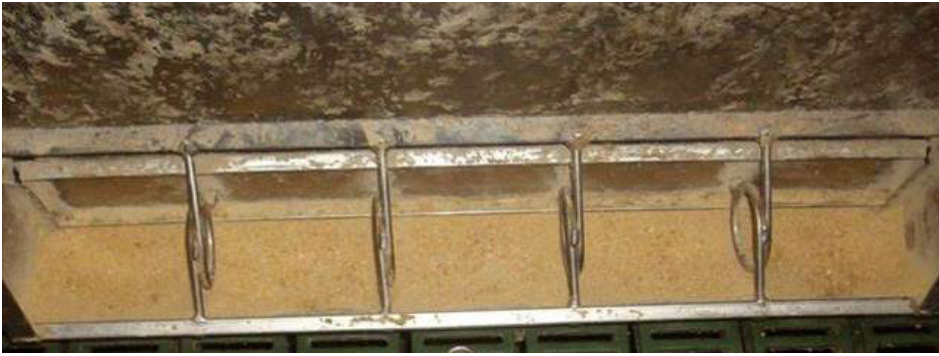
Figure 10. Wide feeder adjustment with meal diet (minimum feeder gap was 1.00 in. with a maximum gap of 1.25 in.) averaged 98% feeder pan coverage.