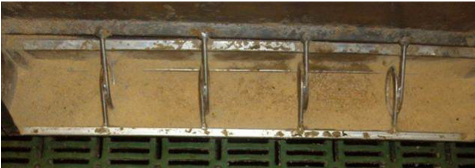
Figure 11. Wide feeder adjustment with 70% pellets + 30% fines (minimum feeder gap was 1.00 in. with a maximum gap of 1.25 in.) averaged 99% feeder pan coverage.