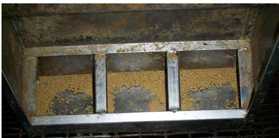
Figure 3. Narrow feeder adjustment with screened pellets (minimum feeder gap was 0.50 in. with a maximum gap of 0.75 in.) averaged 37% feeder pan coverage.