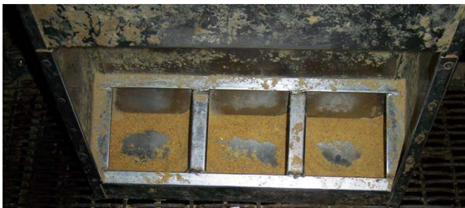
Figure 1. Narrow feeder adjustment with meal diet (minimum feeder gap was 0.50 in. with a maximum gap of 0.75 in.) averaged 42% feeder pan coverage.