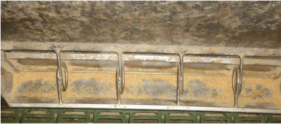
Figure 7. Narrow feeder adjustment with meal diet (minimum feeder gap was 0.50 in. with a maximum gap of 0.75 in.) averaged 52% feeder pan coverage.