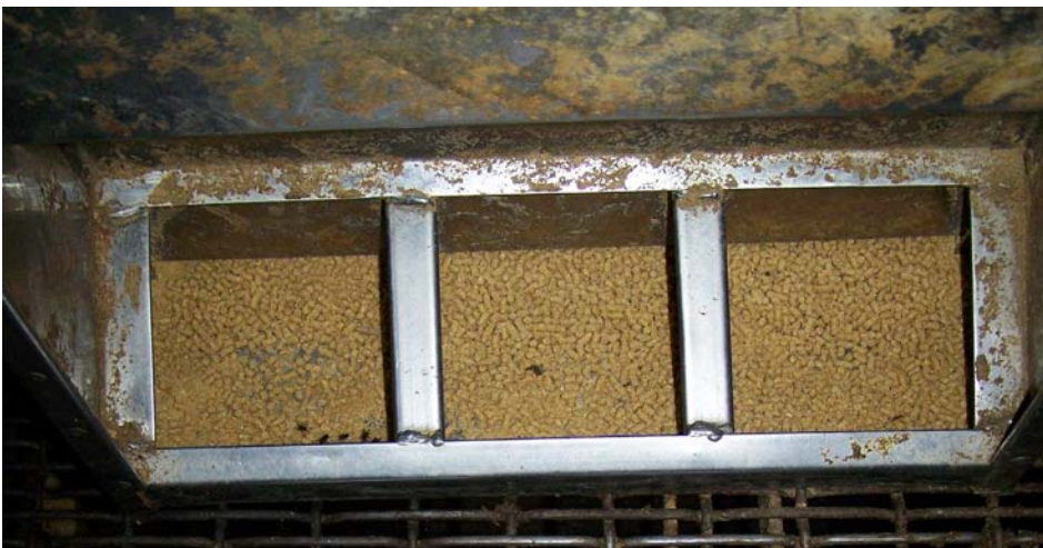
Figure 6. Wide feeder adjustment with screened pellets (minimum feeder gap was 1.00 in. with a maximum gap of 1.25 in.) averaged 93% feeder pan coverage.