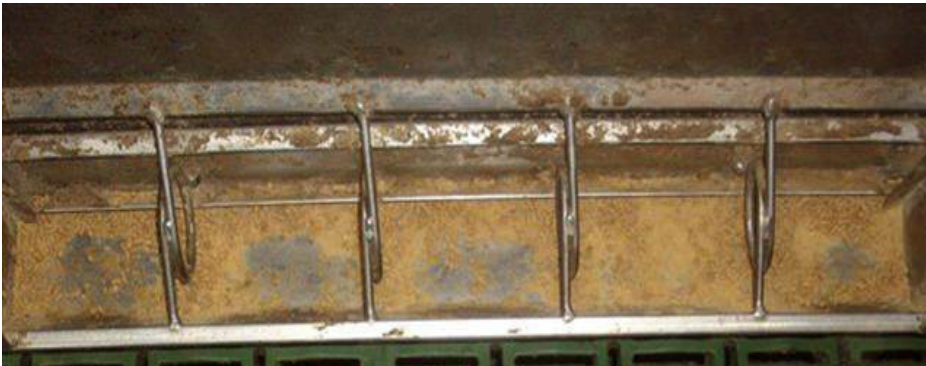
Figure 9. Narrow feeder adjustment with screened pellets (minimum feeder gap was 0.50 in. with a maximum gap of 0.75 in.) averaged 57% feeder pan coverage.